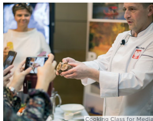
Cooking Class for Media